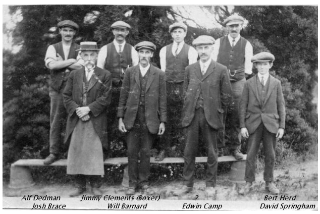
The "Camp Choir" of St. James's Church