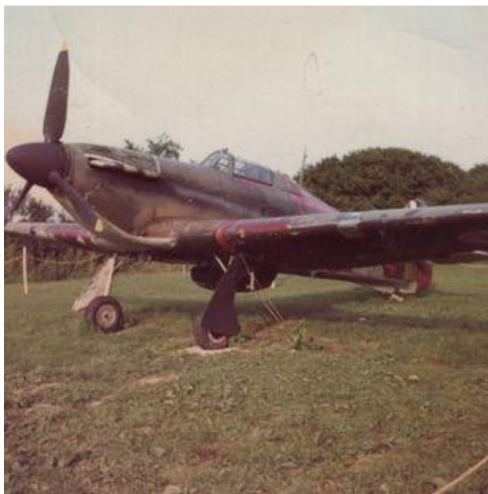
The famous Hurricane.