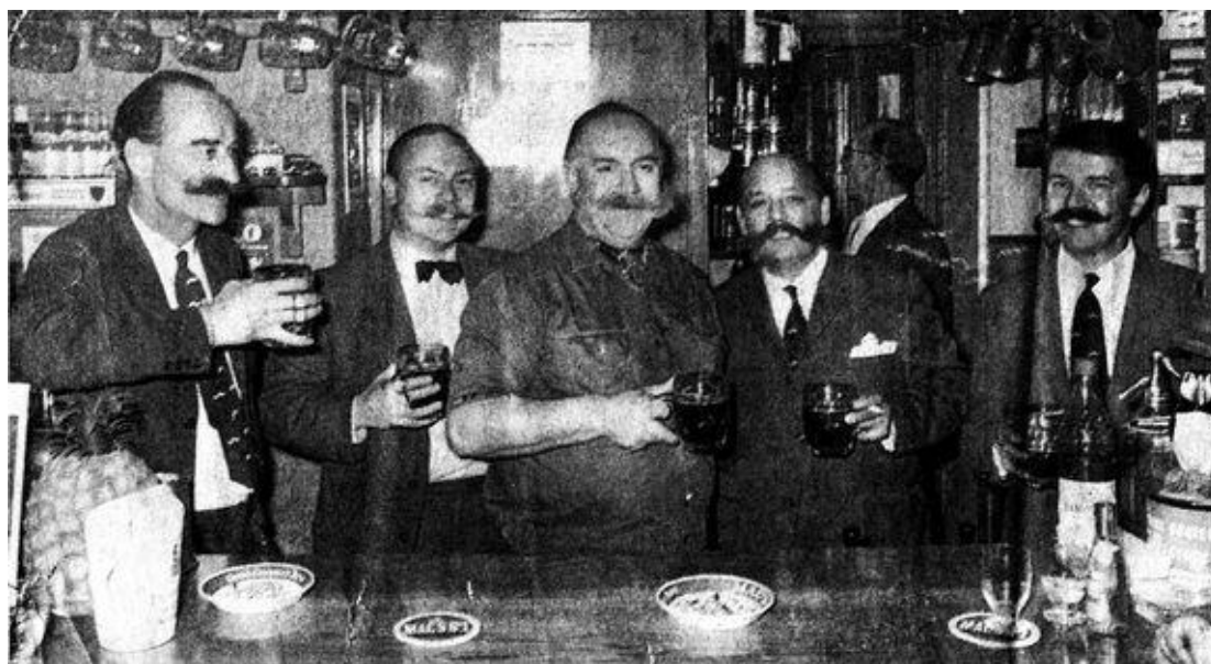
Opening night 1968: the Handlebar Club at the QH