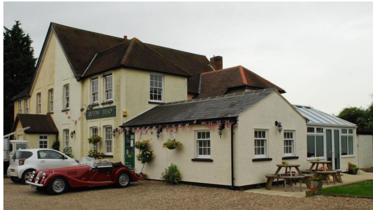
The Queens Head as it looks nowadays