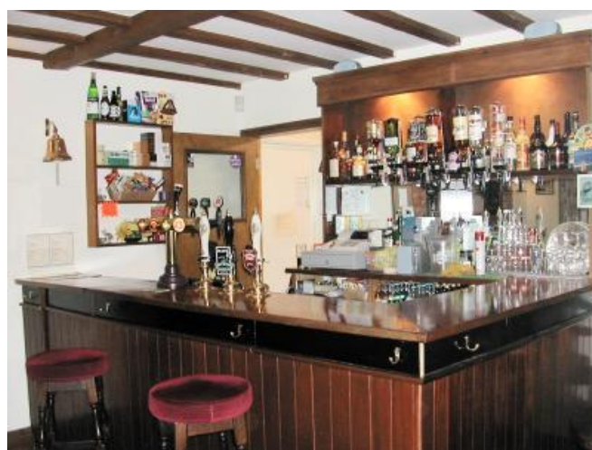
2015 The QH's interior.