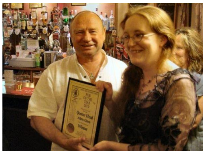
2010: the QH once again CAMRA's pub of the year.