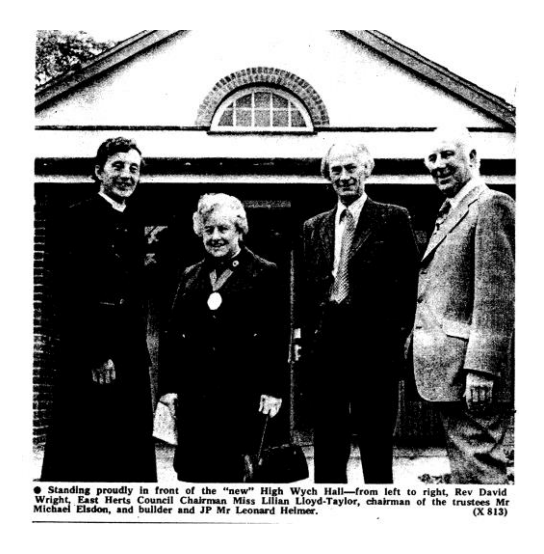
1973 - The New Hall is revealed