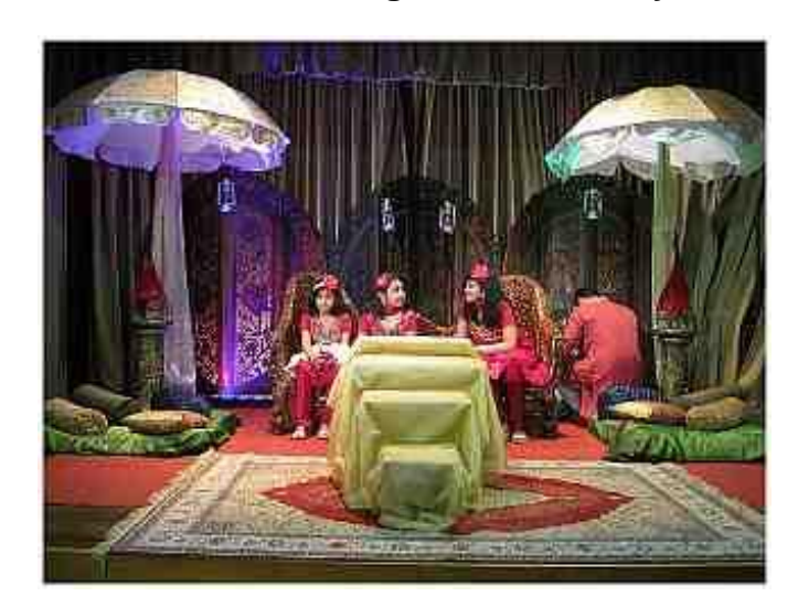
The 21<sup>st</sup> Century - A Muslim Wedding at High Wych Memorial Hall