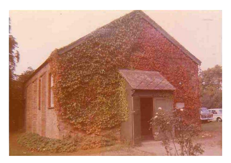
High Wych Memorial Hall in 1965