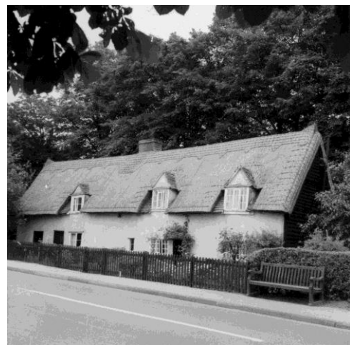
The village green in 1965