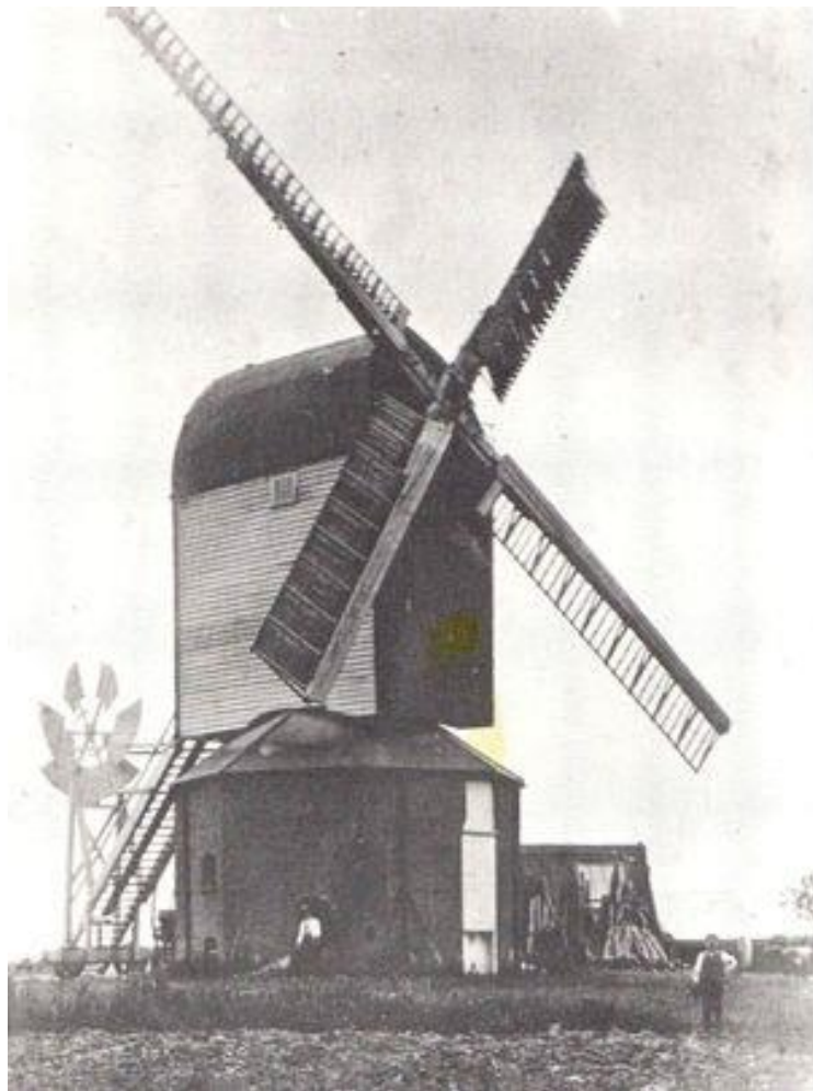
Throws Mill in Little Dunmow around 1912

Three factors played a role. Firstly the repeal of the corn laws opened up British markets to foreign grown corn much cheaper than the home grown stuff and often even of better quality. High Wych mill was of course a corn mill and foreign grown corn was mostly ground near the ports where it as unloaded. Secondly in the early to mid seventies of the 19 th century there were a number of particularly bad harvests. Thirdly Sawbridgeworth mill, then owned by the Barnards was about to be rebuilt and converted to steam, a much more reliable provider of energy.