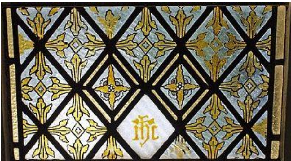
The Lindsell stained glass window