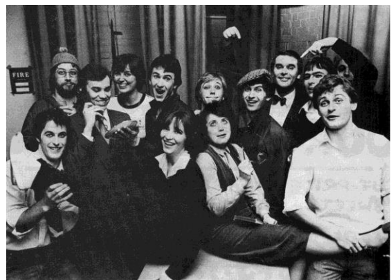
The High Wych Variety Group in 1983