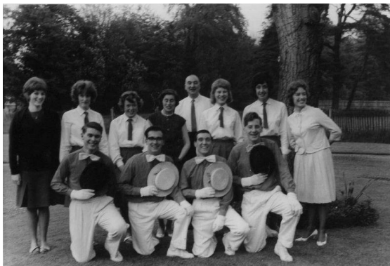
1963 the "autumn collection" review