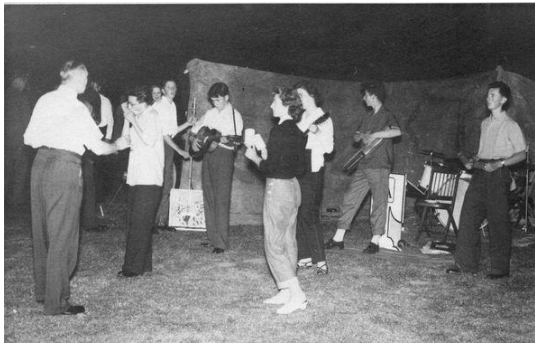
1956 hw skiffle group – note the conductor !!