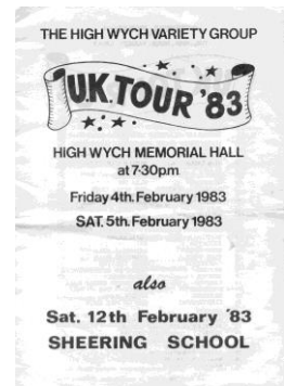
Souvenir programmes from 1974 and 1983