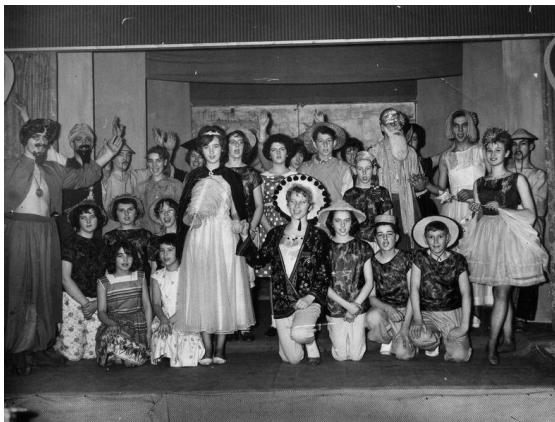
1962 The cast of Alladin.