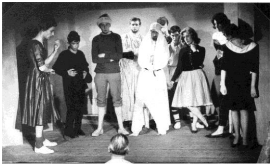
1961 – The cast of Dick Whittington