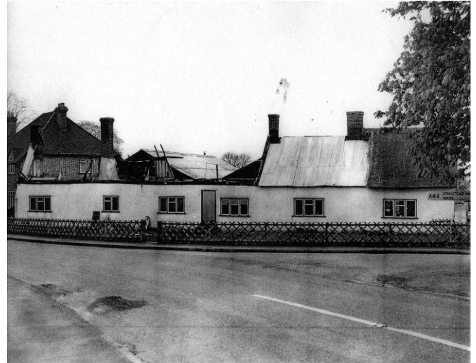
Saturday 28 th April 1951 Fire at Helmer & Dyer