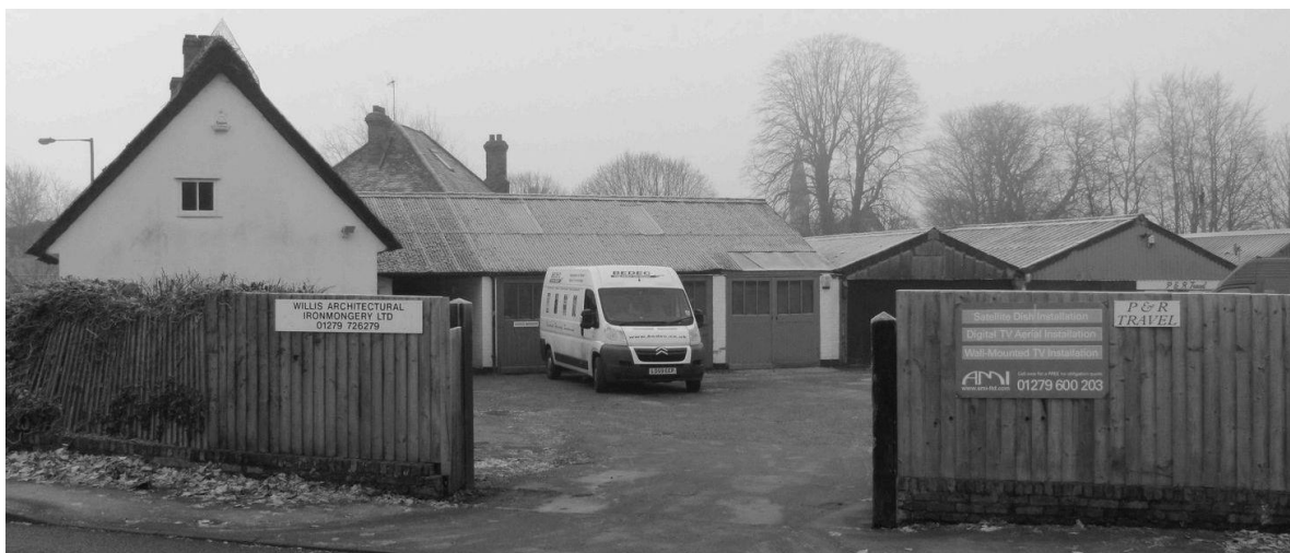
Helmer's yard as it is today